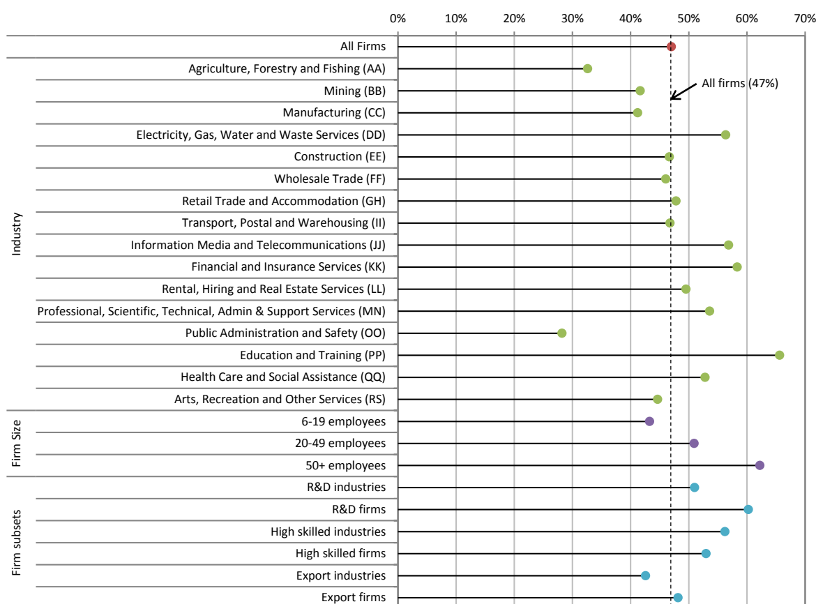
Figure 3.2 Percentage of innovating firms indicating new staff are an important source of new ideas for innovation, pooled years

Finally, we looked at whether firms had entered a new export market in the past year