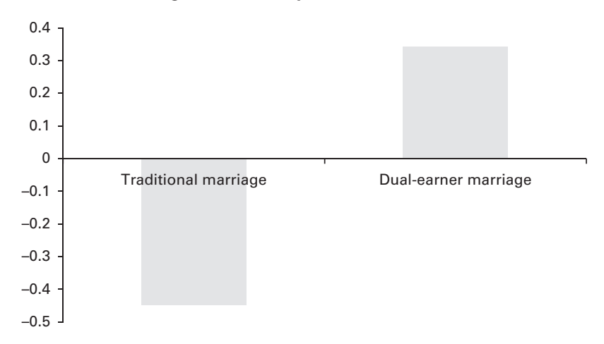
Figure 4. Effect of entering into a traditional or dual-earner marriage structure on change in men's attitudes toward working women (Study 5).

into a dual-earner marriage structure positively related to change in attitude toward health care (B=0.09, not significant). Because our analysis did not yield a significant association between marriage structure and attitude toward health care (a theoretically unrelated variable), it helps validate the existing analyses, whereas if the new model had shown a significant association, it would have implied that the main finding was likely to have been an artifact. ^6