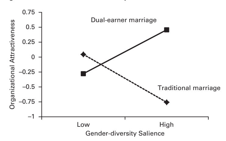
Figure 2. Marriage structure, gender-diversity salience in the workplace, and men's perceptions of organizational attractiveness, Study 3.

expected, the regression coefficient for the two-way interaction term between salience of gender diversity and traditional marriage structure was significant (p < .001). Moreover, the two-way interaction term for dual-earner marriage was also significant (p < .001). As depicted in figure 2, we observed that men in traditional marriages found more gender-diverse organizations less attractive.